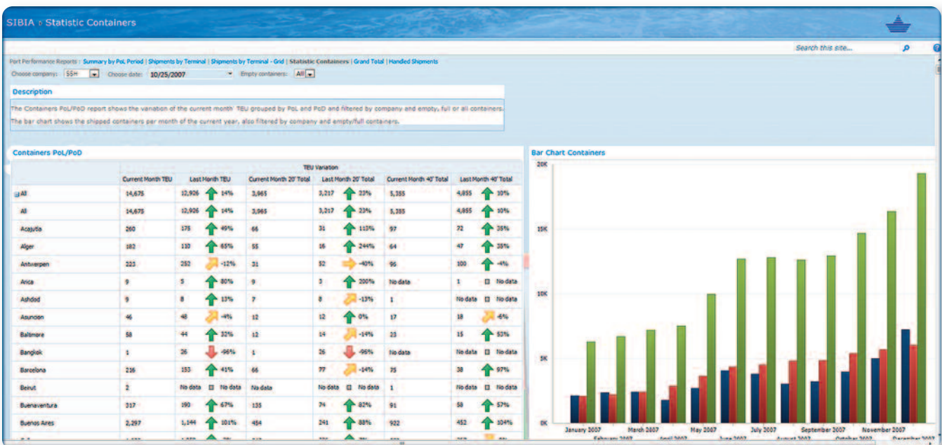
Keeping track of your container liftings

SIBIA takes information from across the company including revenues and costs from all business areas. User-defined data is delivered through a web browser or is accessible via Excel allowing you a